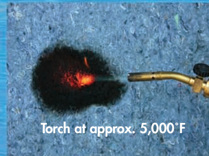
Torch at approx. 5,000°F